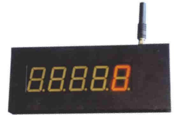
Wireless Remote Display (Option)