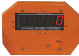
Thermal Scale with cover