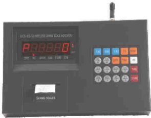
Wireless Remote Indicator with Printer (Option)